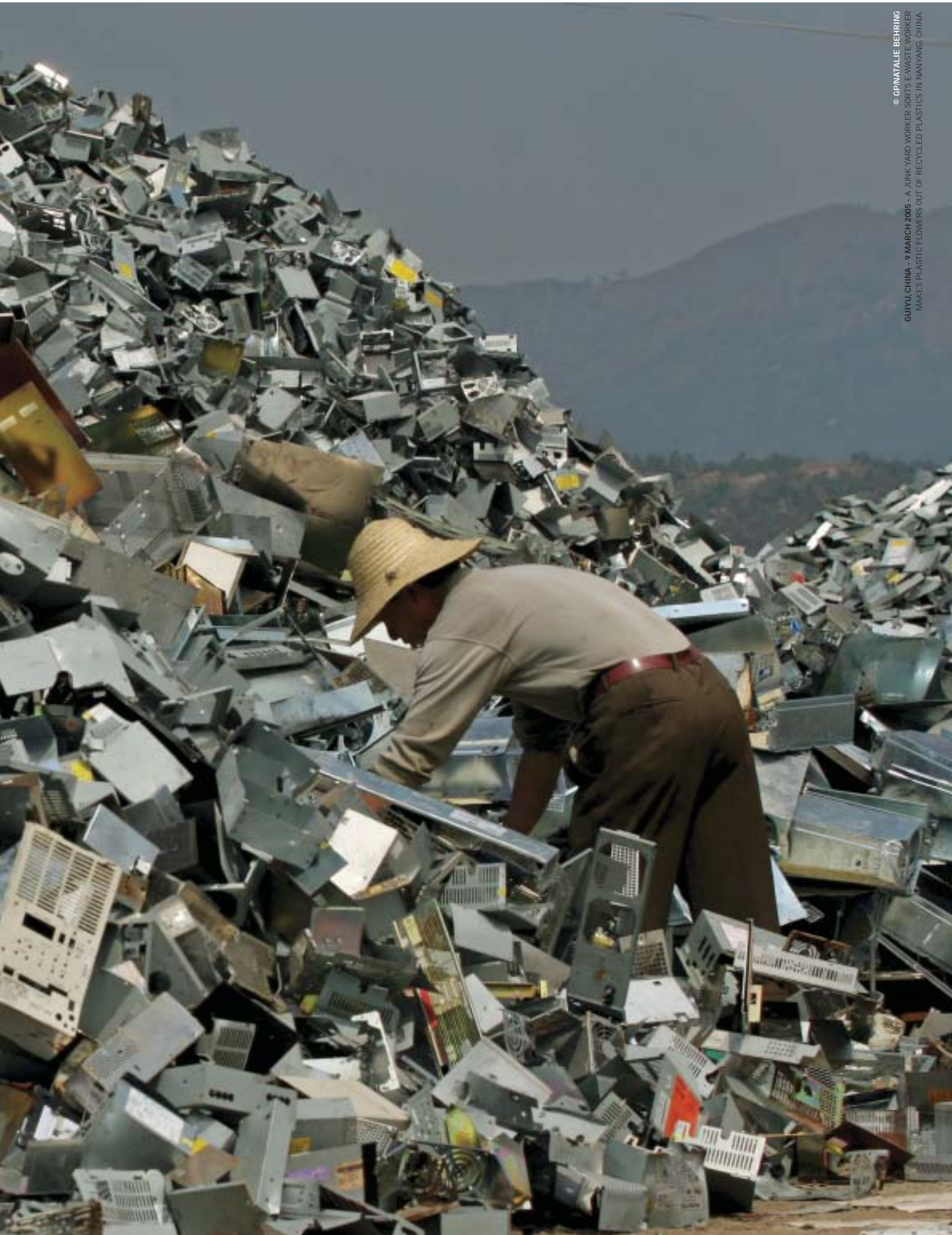
GUIYU, CHINA - 9 MARCH 2005 - A JUNK YARD WORKER SORTS E-WASTE WORKER MAKES PLASTIC FLOWERS OUT OF RECYCLED PLASTICS IN NANYANG, CHINA.