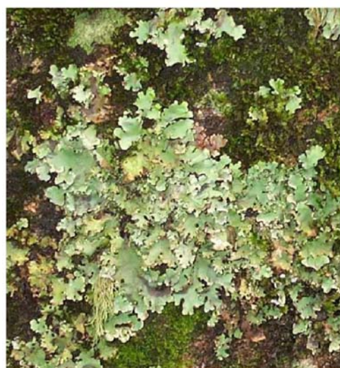
Type B, Parmotrema reticulatum