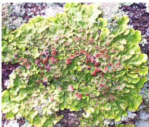
Type A, Lobaria discolor

All samples were immediately sealed and cooled upon collection. The samples were returned to the Greenpeace Research Laboratories in the UK for analysis.