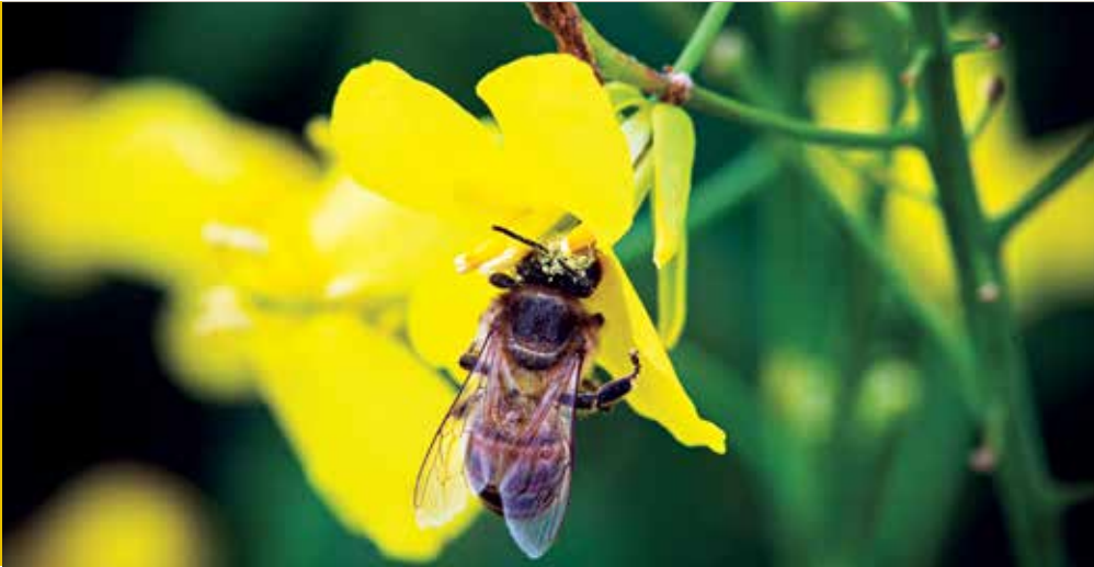
Bee collecting pollen from rape flowers, Germany.