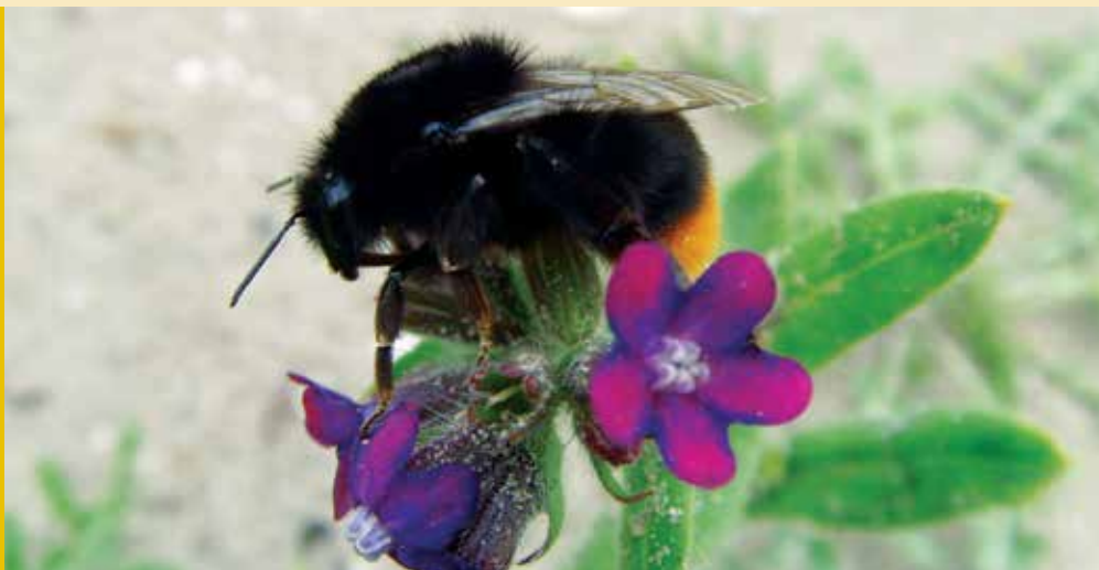
The red-tailed bumblebee ( Bombus lapidarius )