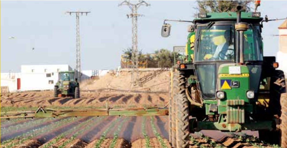
A tractor spraying pesticides on cabbage plants on a vegetable farm in Spain.