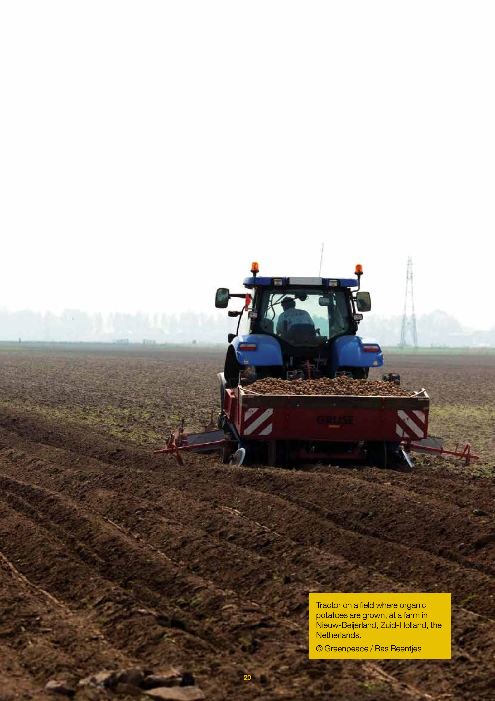
Tractor on a field where organic potatoes are grown, at a farm in Nieuw-Beijerland, Zuid-Holland, the Netherlands.