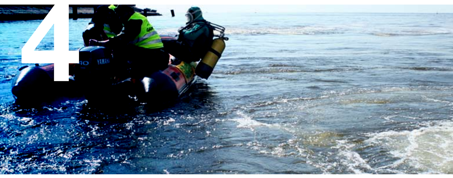
Underwater effluent dispersing pipe of Central WWTP, located at Nevskaya Guba, Gulf of Finland, St-Petersburg, Russia, 2007.

A range of different analyses was carried out on the various samples collected, depending on the sample type. A summary of the type of analyses for each group of samples is given below.