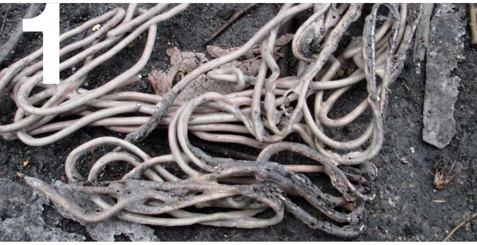
E-wastes burning area located at the Obukhovskoy oborony prospekt, at the place where Murzinka River enters pipeline, St-Petersburg, Russia, 2007.