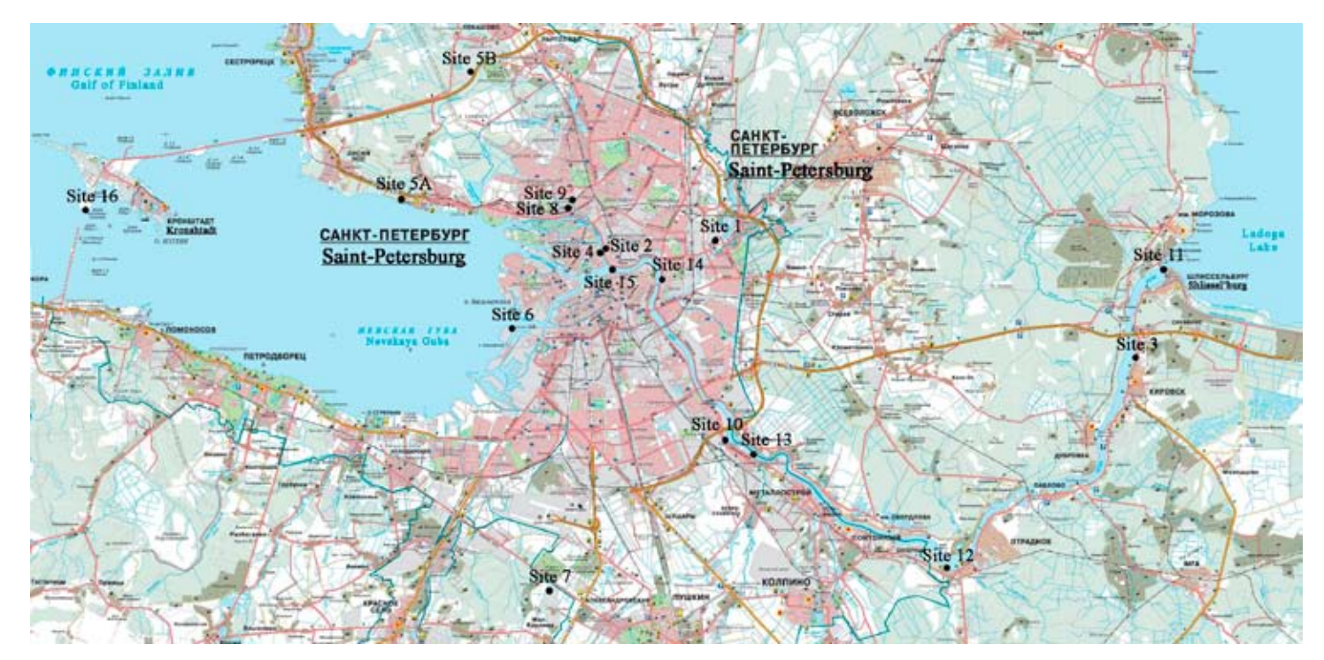
Fig. Location of the sampling sites, St-Petersburg, Russia, 2007.

separate 20 ml auto sampler crimp top vials (four vials per sample). Sediment, sludge and soil samples were collected in 100ml screwcap bottles. All samples were kept cool and dark, and were returned to the Greenpeace Research Laboratories (University of Exeter, UK) for analysis. Detailed descriptions of sample preparation and analytical procedures are presented in the Appendix. Locations of the sampling sites are presented in Figure below.