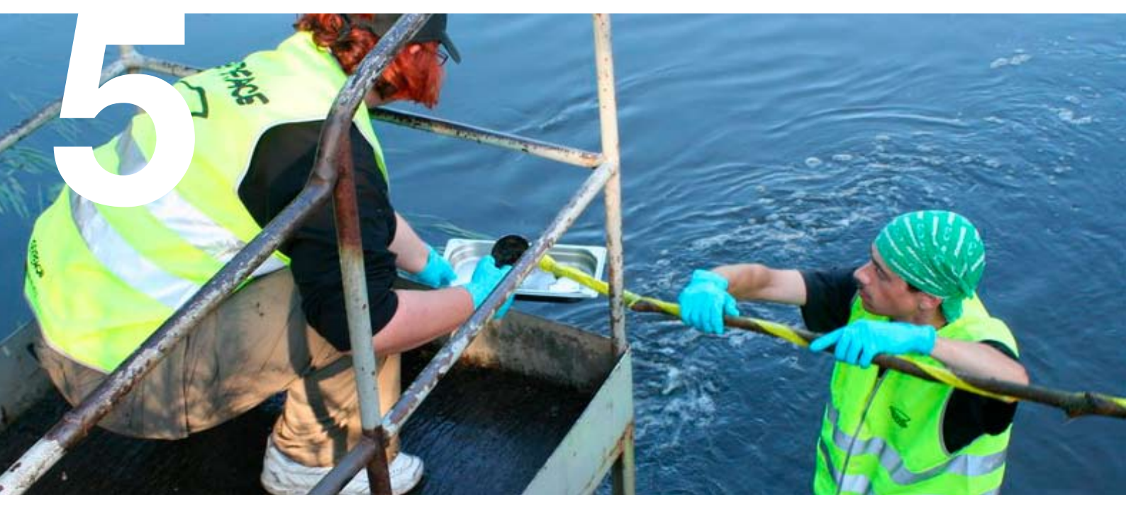
Sediment sampling by the 1st effluent pipe located in front of JSC "Electropult", discharging into the Okhta River, St-Petersburg, Russia, 2007.

The results for the qualitative screening analysis for extractable organic compounds, quantitative analysis for VOCs and quantitative analysis for heavy metals are presented in the following paragraphs 4.1 - 4.4, according to the origin of the samples.