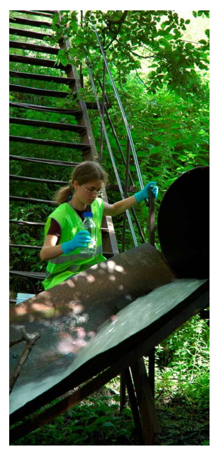
Sampling from effluent pipe located in front of JSC "Ladoga", discharging into the Neva River, St-Petersburg, Russia, 2007.

The presence of PBDEs in all sediment samples starting from the very beginning of the Neva River down to its delta in the Nevskaya Guba, part of the Gulf of Finland, may indicate long term discharge of these chemicals into the river and, possibly, even into the Ladoga Lake from which Neva River originates. PBDEs are persistent and highly bioaccumulative chemicals which have been found in sediments, fish, bird eggs, and humans (Allchin &